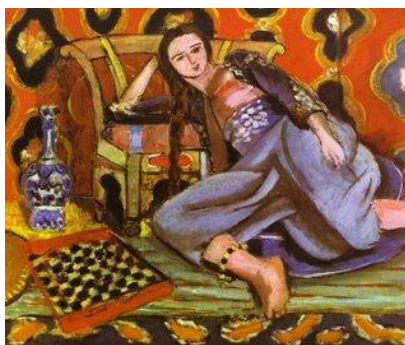
Tribute to Henri Matisse, "Odalisque on a turkish sofa " (1928, Musée d'Art Moderne de la Ville de Paris, Paris)